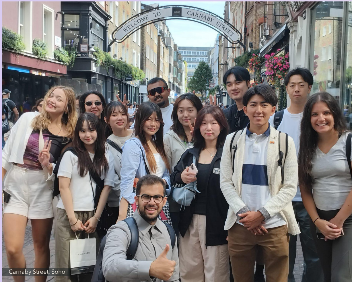
Carnaby Street, Soho

We believe in teaching English in a fun and practical way, building your confidence by putting you in real situations in one of the world's most exciting capital cities.