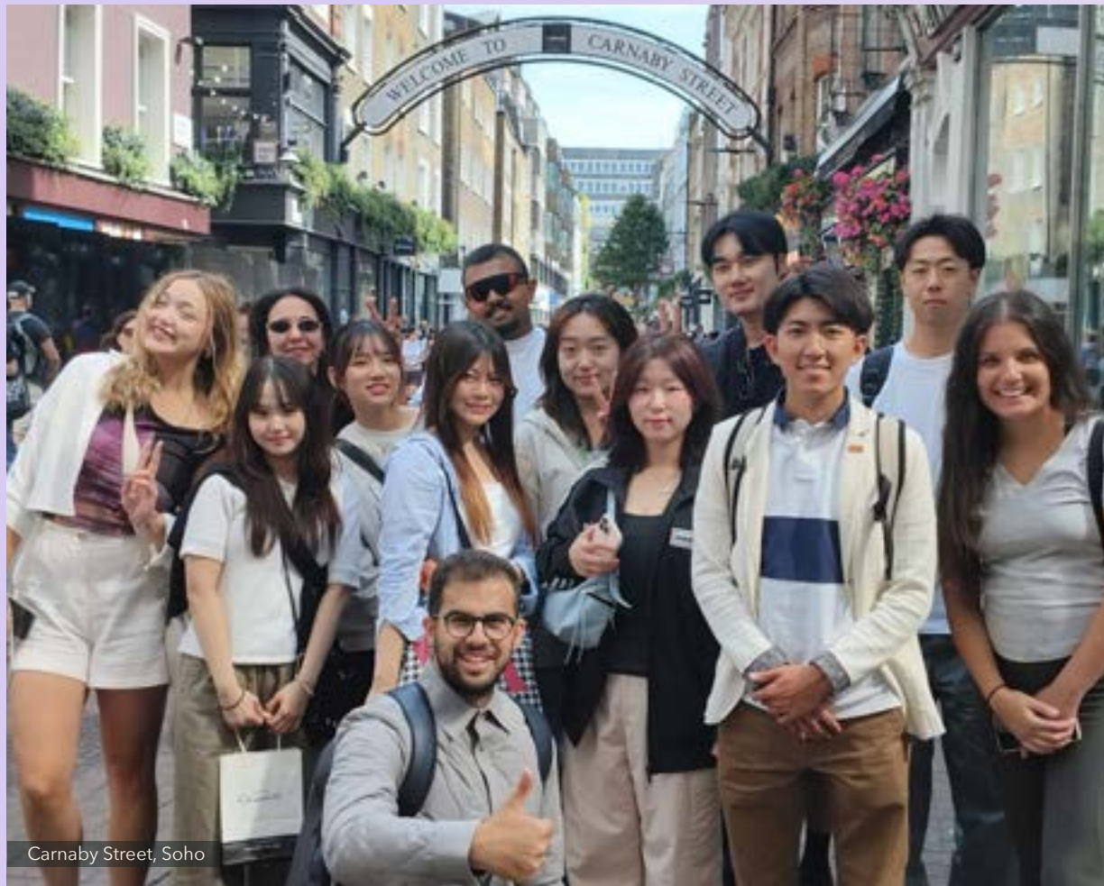
Carnaby Street, Soho

We believe in teaching English in a fun and practical way, building your confidence by putting you in real situations in one of the world's most exciting capital cities.